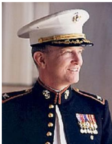
Col. Ronald D. Ray

WTC Building 7 was 610 feet tall, 47 stories. It would have been the tallest building in 33 states. Although it was not hit by an airplane, it completely collapsed into a pile of rubble in less than 7 seconds at 5:20 p.m. on 9/11. However, no mention of its collapse appears in the 9/11 Commission's " full and complete account of the circumstances surrounding the September 11, 2001 terrorist attacks. " (Video of WTC 7's collapse is at http://www.whatreallyhappened.com/IMAGES/WTC7_Collapse.wmv .) And six years after 9/11, the Federal government has yet to publish its promised final report that explains the cause of its collapse.